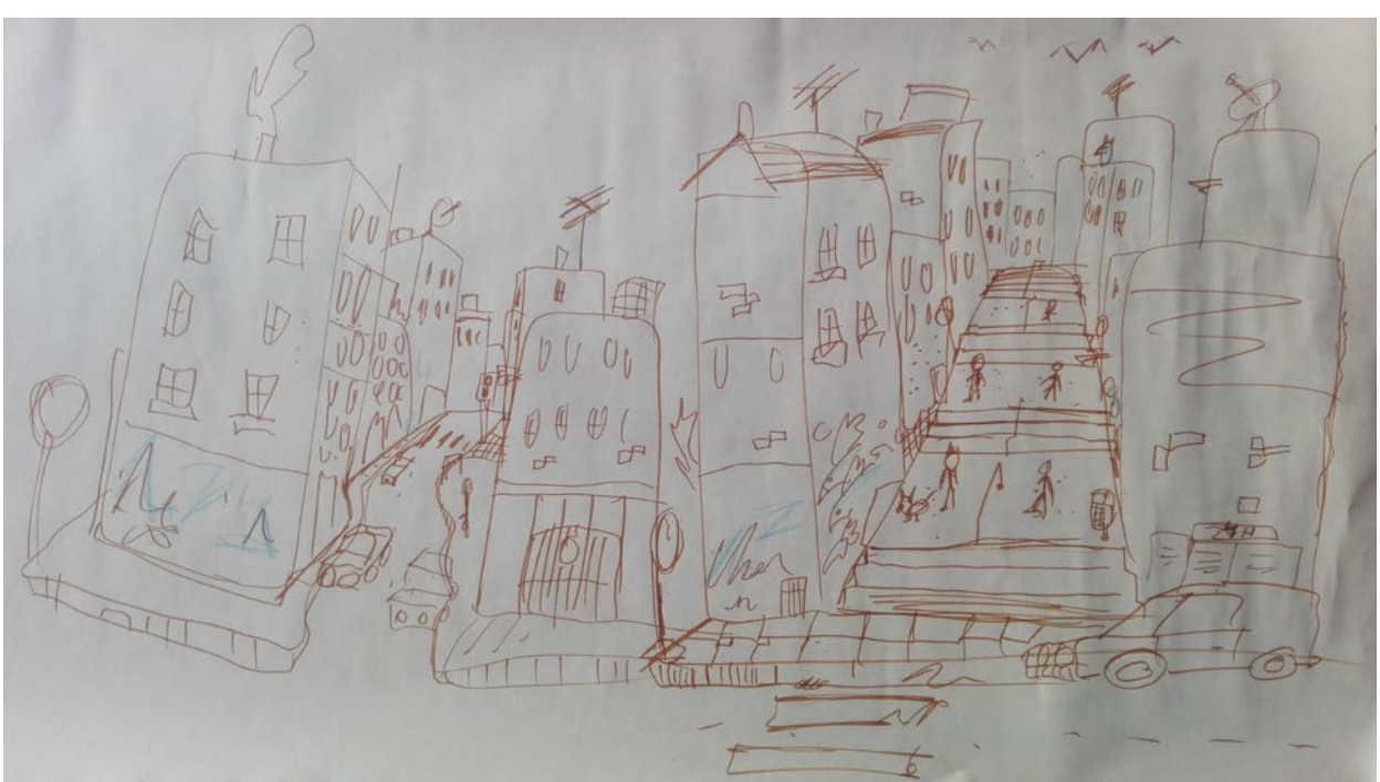
Images 13. Fragments of the psychogeography cartography created by the Pablo Picasso Art and Design College's students (A Coruña) after the urban dérive.