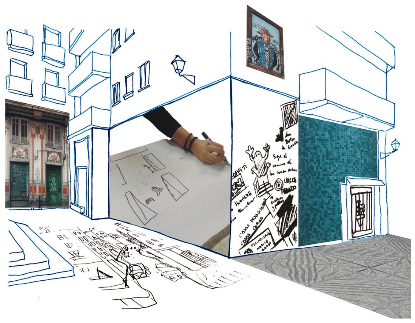
Image 10. Collage based on the photographs taken during the urban dérive with Pablo Picasso Art and Design College's students (A Coruña).