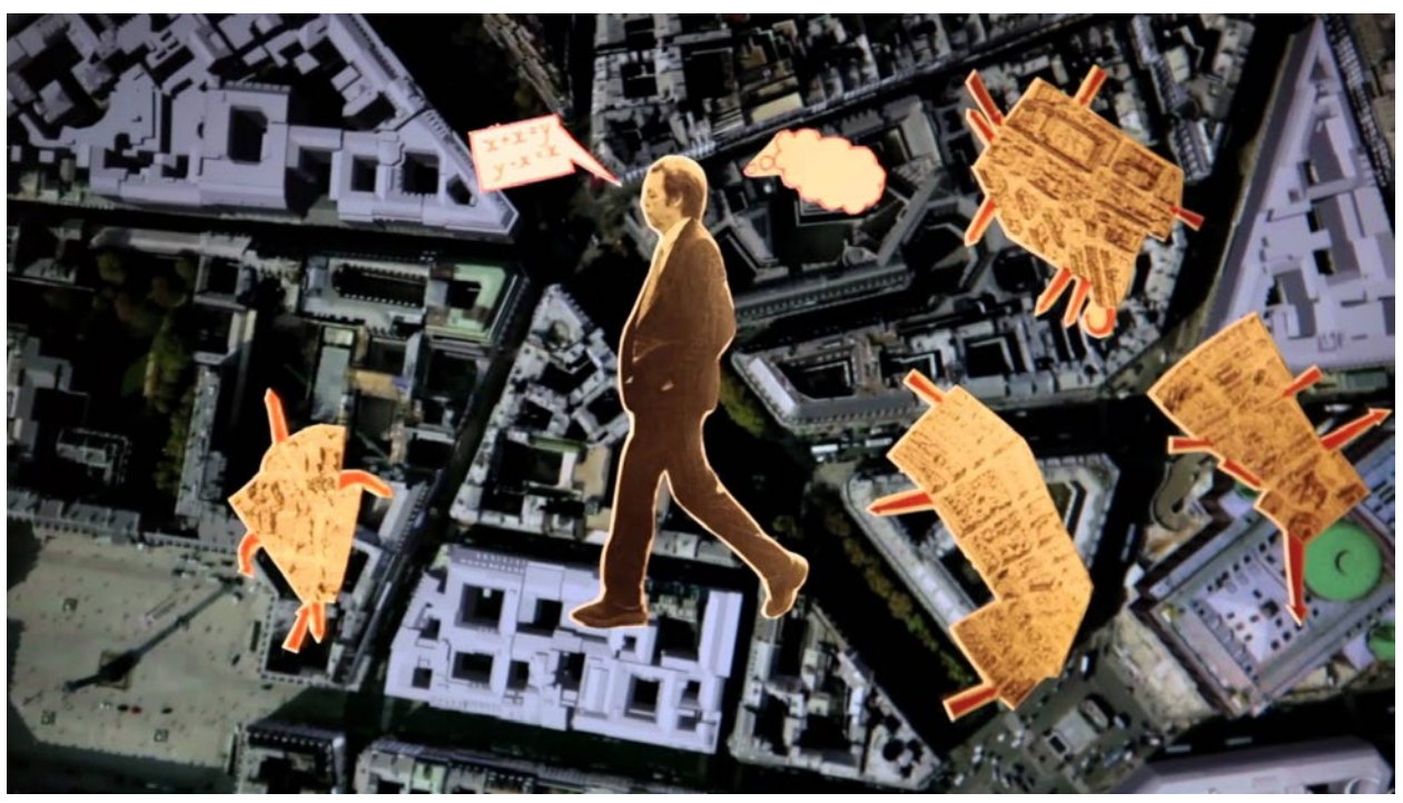
Image 6. Dérive App. Technological tool of support for urban dérives

concepts, techniques and practices based on the arts, contemplating the use of a wide variety of methodologies based on artistic creation to carry out own research/experience and/or communicate their understanding through genres as diverse as narrative, poetry, painting, sculpture, photography, illustration, theater, dance, music, performance. In other words, it supports a transdisciplinary approach that can meet other disciplines that are in the context treated.