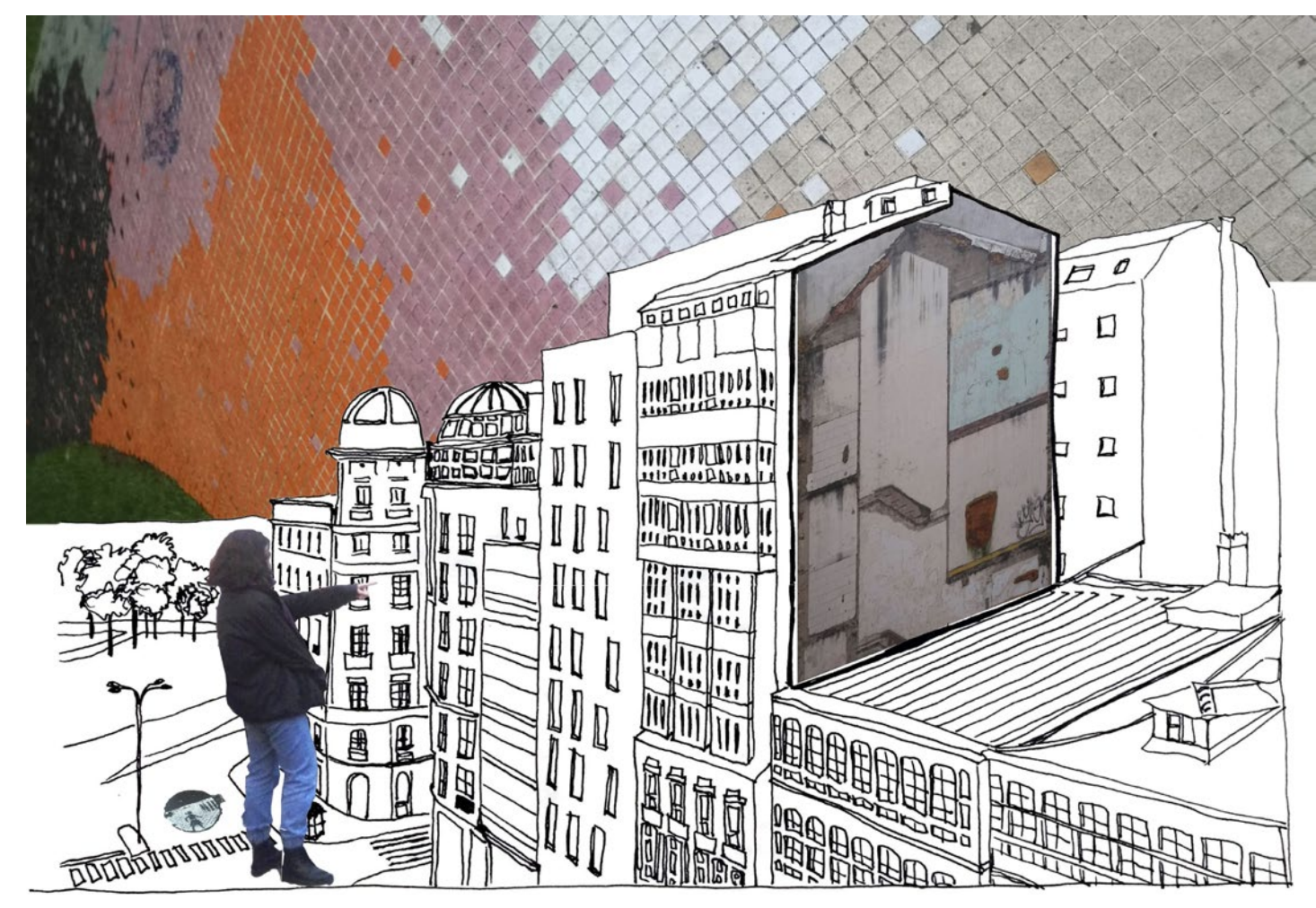
Image 2. Collage based on the photographs taken during the urban dérive with Pablo Picasso Art and Design College's students (A Coruña).

Under these theoretical premises, an urban dérive experience was carried out with students from the Pablo Picasso Art and Design College of A Coruña (Spain). It was the first time this was done as a group exercise, and, therefore, it adopts an introductory character. Nevertheless, it generated a process of active involvement of the students, giving rise to reflections that reflect a sensitive interaction and aesthetic and personal appreciation of the nearby urban environment. In this text we describe the practice carried out and some of its results.