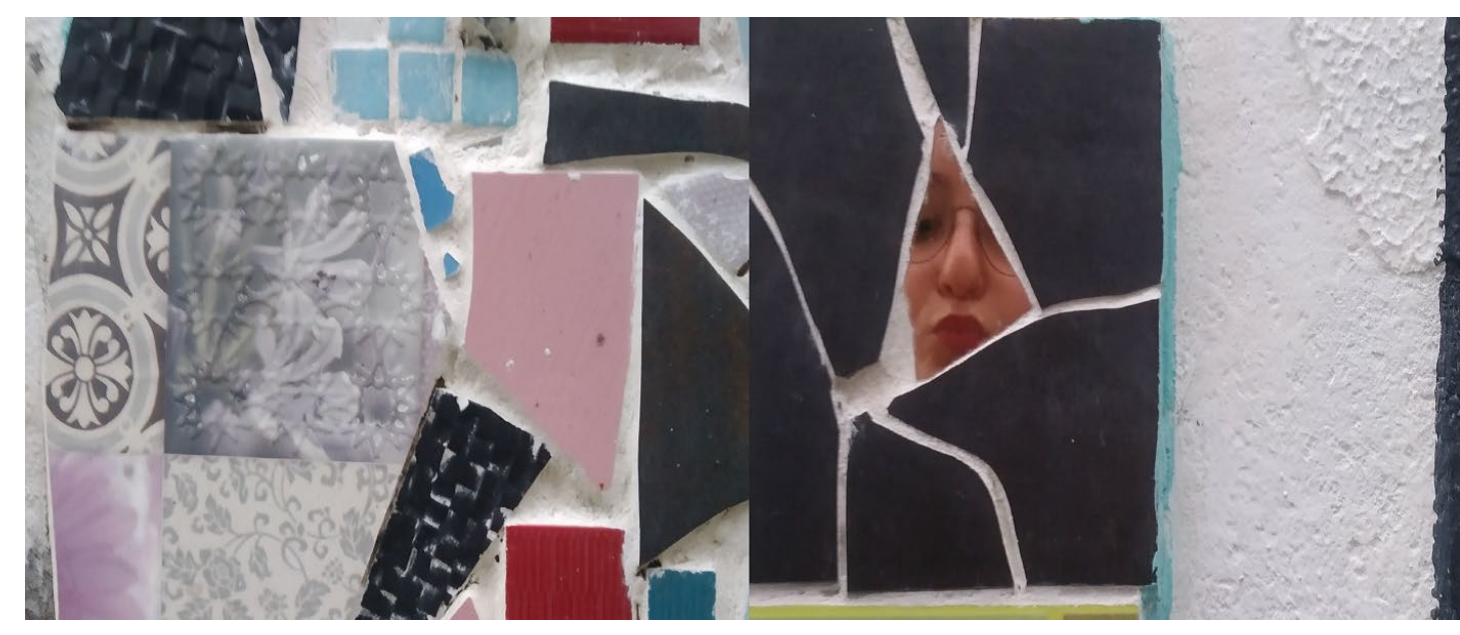
Image 12. Photography taken by a Pablo Picasso Art and Design College's student (A Coruña) during the urban dérive.

It is worth highlighting reflections on territorial organization, design perspectives sought, social groups according to neighborhood zones, flows depending on the time of the day, commercial activity on the streets, material compositions of the built elements, objects abandoned or intentionally placed by citizens, provision of the limit of the private and the public, the window as an entrance to privacy, the arrangement and care of gardening elements, the relationship of spaces with personal experiences and the transformation of places over time.