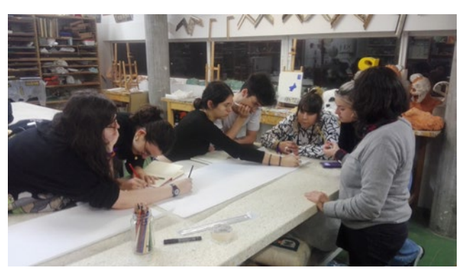
Images 11. Photographs taken during the urban dérive and the elaboration of a psychogeography cartography with Pablo Picasso Art and Design College's students (A Coruña).