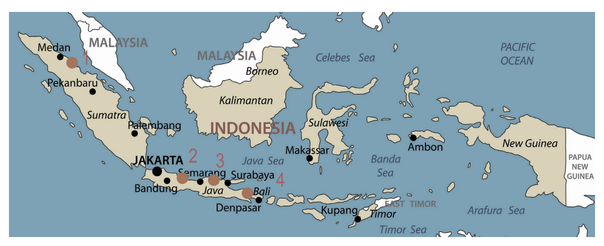
Fig. 05. 1. Santo Fransiskus Asisi Church, Berastagi (Sumatra); 2. Church of the Sacred Heart of Jesus, Ganjuran (Yogyakarta); 3. The Pohsarang Church, Kediri (East Java); 4. The Sacred Heart Cathedral, Palasari (West Bali).

the solution for the new Dutch-Indies architecture and argued local factors (Santosa 2010).