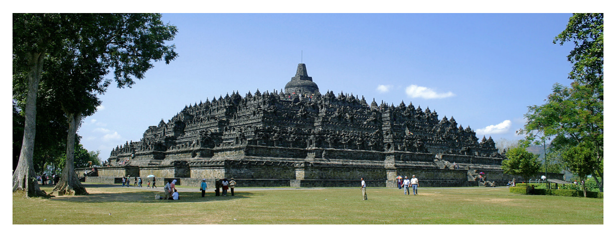
Fig. 01. Buddhist Borobudur temple (Central Java, ca. 750-850).