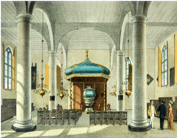
Fig. 04. The Portuguese Outer Church (now named Sion Church) (Batavia), 1881-89; colour lithograph after an original watercolour by Rappard.

East Asia and established the United Dutch East Indies Company (VOC 1602), while Jan Pieterszoon Coen decided on a government capital in Batavia (now Jakarta), forbidding all Catholic missions in its region. However, the French Revolution (1789) and later the fusion of the Netherlands into the French authority gave a new direction to the Dutch colonies, following Napoleon's principles (freedom/equality/brotherhood) to express the freedom of their faiths. A new chapter to carry on the Catholic mission started (Fig. 04).