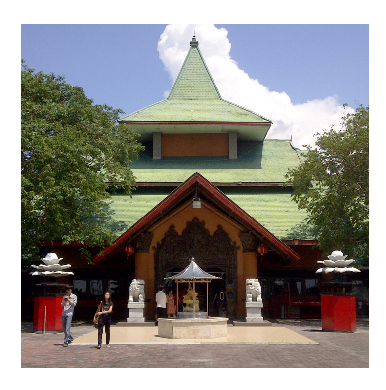
Fig. 11. Sanggar Agung Temple, Surabaya (East Java), 1999, with Javanese roof style and Buddhist lotus buds.

collected and individual memory. Another development is a theory of communicative memory, a variety of collective memory based on everyday communication. This memory format resembles the interactions in an oral culture or the memories collected through oral history. With this activity, each memory involves contacting other groups whose unity and characteristics are devised through a public image of their past. Each person is a valuable agent of groups and handles collective self-images and memories (Assmann 2008). Recently, Historian Rieff (2016) differentiates the term collective memory between memories of people alive during the events and people who learn about them from culture or media, indicating cultural accentuation on specific historical occasions. At any rate, further discussions of collective memories take place in another field, such as psychology.