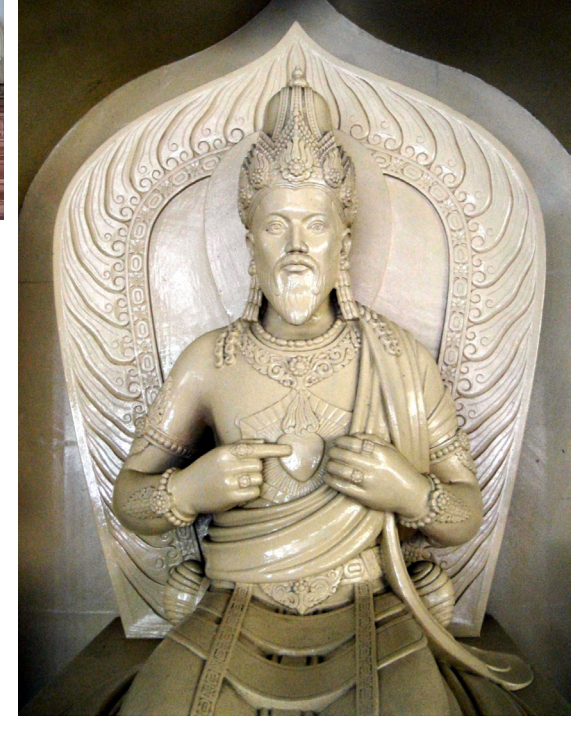
Fig. 09. Julius Schemutzer, The Sacred Heart of Jesus, Ganjuran, Yogyakarta (Central Java), 1924. Javanese traditional roof and ornaments such as pre-Islamic triangular tumpal and lotus-motifs can be seen, transferred through the Islamic Java period to underline regionalism.