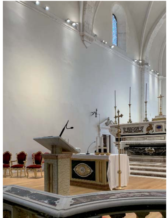
Fig. 12-13. Basilica di Santa Maria di Collemaggio, L'Aquila (Italy), 2019; after the restoration.