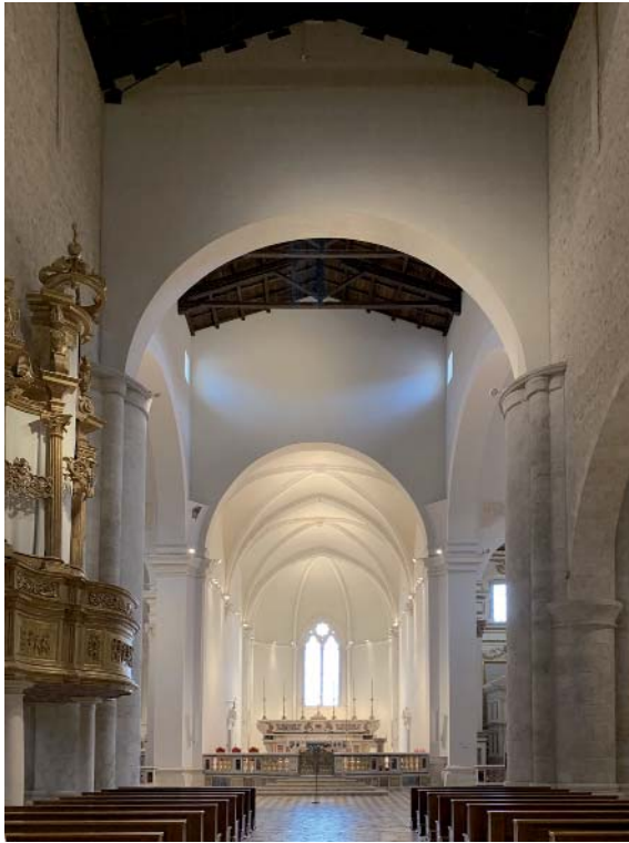
Fig. 14. Basilica di Santa Maria di Collemaggio, L'Aquila (Italy), 2019; after the restoration.

ancient buildings and cultural heritage. The last, and probably the most difficult, topic to investigate is the weight of cultural, cultural and memorial issues on the dynamics of reconstruction and application of liturgical reordering in churches.