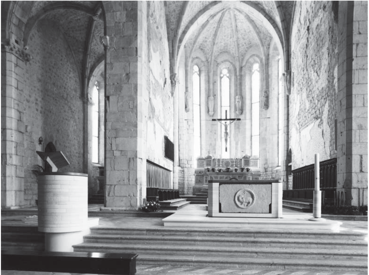
Fig. 01. Sandro Pittini. Sant'Andrea Apostolo, Venzone (Italy), 1995; liturgical reordering.

Giuseppe Varaldo, expresses doubts about this argument, by noting the possible limits of an extensive attachment to the tradition and to the architectural formalism (Varaldo, 1979). Although several reflections were conducted during the conference, no official guidelines for the reconstruction of churches in Friuli were promulgated. Then, the churches were in time rebuilt by applying different solutions and approaches. For this reason the Friuli experience is considered as a «large scale lab for the new architecture of churches» (Della Longa 2013, 129-138). This is true not only for the high number of rebuilt churches but also for particular circumstances. In that time,