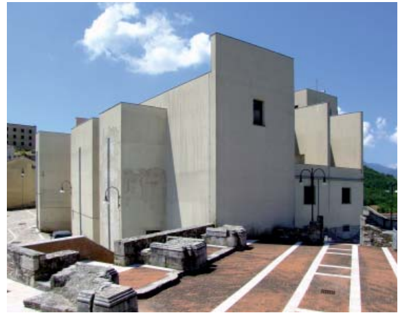
Fig. 03-04. Giorgio Grassi. Chiesa Madre, Teora (Italy), 1981-83/2011.