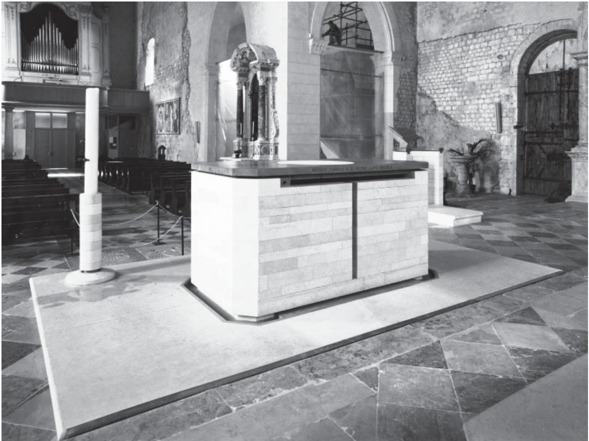
Fig. 02. Sandro Pittini. Sant'Andrea Apostolo, Venzone (Italy), 1995; liturgical reordering.

Della Longa, 2013). Moving by the precious contribute of Giorgio Della Longa (2013) it is possible to investigate some exemplar cases. These three cases represent the three pursued approaches in the Friuli churches reconstruction: the reconstruction how it was, where it was ; the reconstruction following the local architectural tradition; the reconstruction following contemporary architectural orientations.