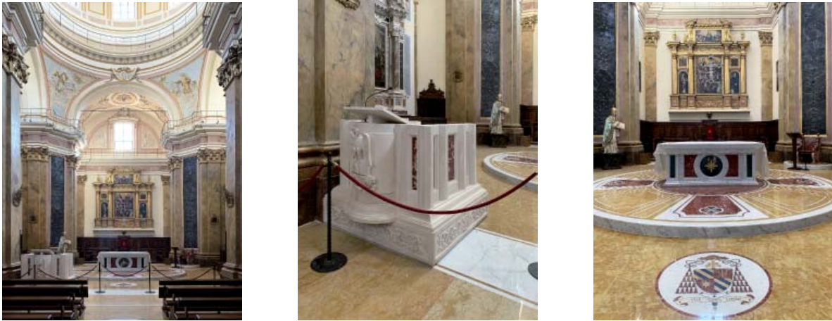
Fig. 07-09. Santa Maria del Suffragio, L'Aquila (Italy), 2019; liturgical reordering.

the field of our research, the 2009 L' Aquila seismic event is particularly relevant for two main reasons. The first is related to the fact that in 1985 the statute of the Italian Conference of Bishops was approved and later the National Office for cultural heritage and the National Office of ecclesiastical buildings were established (in 2016 the two apparatus merged in to a single organization: the National Office of Cultural Heritage and Ecclesiastical Buildings). 8 In the early 90's this resulted in the promulgation of the guidelines for the design of new churches and liturgical reordering of churches. 9 The second important factor is that the 2009 L' Aquila seismic event mostly affected the area of the historical center, where a great number of strategic buildings and architectural heritage among which ancient churches, were placed. Many of these are still unusable or under reconstruction works, as the Santi Massimo e Giorgio cathedral. However, some of the most important churches in the town of L' Aquila have been recently reopened and let a brief overview.