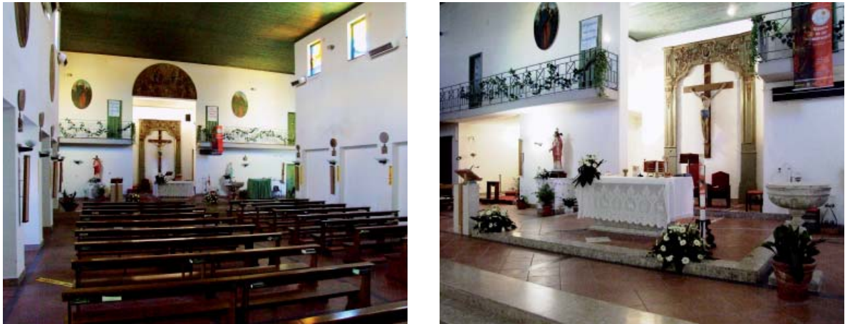
Fig. 05-06. Giorgio Grassi. Chiesa Madre, Teora (Italy), 1981-83/2011.

Nuova Bisaccia there is the Sacro Cuore di Gesù Vita e Risurrezione Nostra church built during the post-earthquake reconstruction process and designed by the architect Aldo Loris Rossi (who was born in Bisaccia). The church is designed according to the liturgical reform but resulted in architectural debates due to its shape configuration.