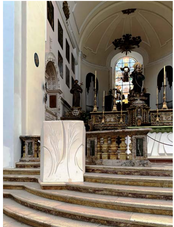
Fig. 10-11. Basilica di San Bernardino, L'Aquila (Italy), 2019; liturgical reordering.