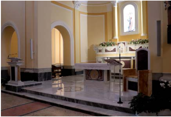
Fig. 09. Santa Maria delle Grazie, Brusciiano-Naples (Italy), 18th century, remodelling 2017-18.

ciplinary perspective will provide useful tools for a positive interaction with local communities and institutions that will be able to better appreciate the value of those religious architectures, often considered not very significant.