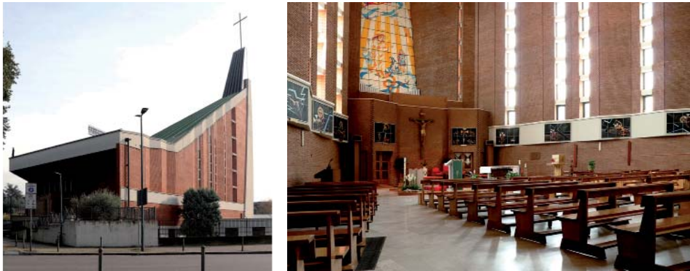
Fig. 10. Antonino Tripodi, San Michele Arcangelo, Turin (Italy), 1966-71.

Sudano, Mauro and Paolo Tomatis. 2017. Architettura, arte e liturgia. Interventi nella diocesi di Torino 1998-2015 . Cantalupa: Effatà.