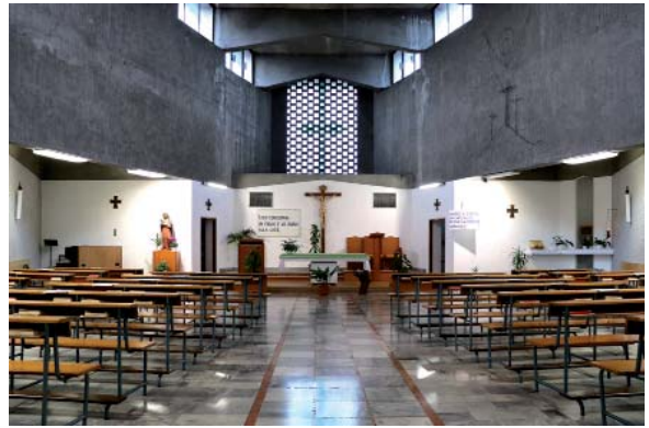
Fig. 01. Luigi Pratesi, San Nicola Vescovo, Turin (Italy), 1960-63.