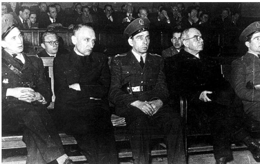
Fig. 01. Prosecution of archbishop József Mindszenty, Budapest (Hungary), 1949.

We point out that these changes coincide with the period of the Council. In accordance with the spirit of the conference, we present the opportunity for appearance of sacral architecture in the period of remission. The publications about modern architecture of Latin America—that are also available in Eastern Europe in the course of time—has almost totally parallel appearance with this process. The analysis was conducted by evaluating periodicals dealing with architecture and liturgy – which had been controlled by the state, so considered to be official opinions of state of art. This time, we disregarded the Western European periodicals of limited availability, but these and the later accessible books could become determining literature starting from the period of political easement.