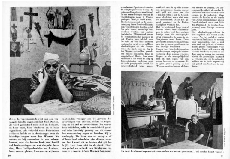
Fig. 01. Portraits of expelled German families, published in EPRO's magazine Echo der Liefde 3 (1954): 10-11.