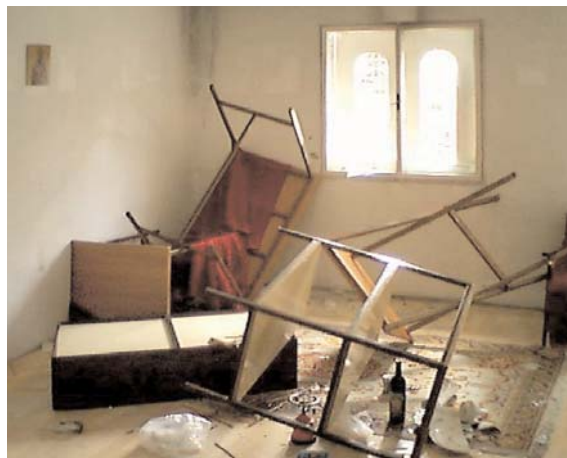
Fig. 07. Chapel of St. Nectarios of Aegina (adapted from prefabricated house), Skopje, after the demolition, 2005.

tion of religious and national identity 22 . Forms of church architecture become the symbol of respect for tradition, while their primary theological and cosmological symbolism becomes less important.