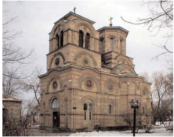
Fig. 04. Holy First Martyr Stephen, Lazarica, Krusevac, 1380.

crosses and temporary prayer facilities. All these forms of religious objects are rare nowadays, for various reasons. Chapels in cemeteries are generally intended for funerals of deceased of all religions as well as atheists, and are only occasionally used for Christian ceremonies. Within the various memorial areas, there are usually existing tombs, monuments and museums and therefore there is rarely enough space to erect new temples. Chapels in hospitals have only started being used as of recently, still in small numbers they are for now mostly confined to regular hospital premises minimally refurbished for the needs of religious services. Priests have only recently been reinstated in the military in Serbia and there is neither modern practice nor modern experience there. Erecting of crosses in public areas is very rare, while mass prayers and services in the open do not include any considerable architectural intervention in the open area 9 .