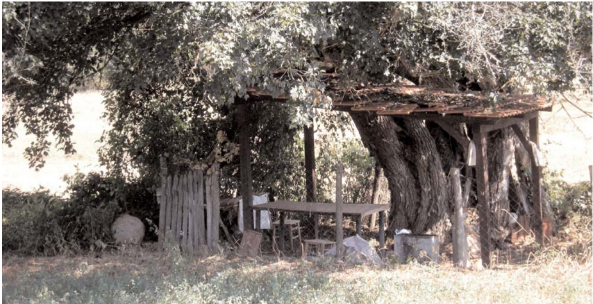
Fig. 08-09. Zapis, Vrtovac (Serbia).