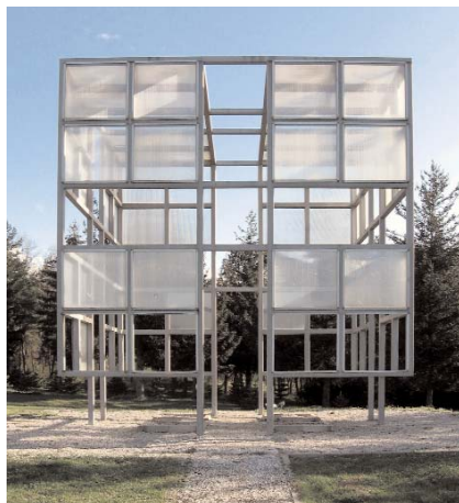
Fig. 05. Sasa Budevac, Chapel in Bubanj Memorial Park, Nis, 2003.

Apart from its role in the procession during the village saint festivity, zapis is a place where weddings, baptizing and other religious ceremonies and prayers can be done, even liturgies, particularly in the villages that don't have churches 18 . That way zapis becomes the village church.