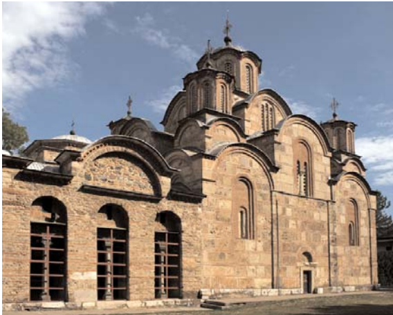
Fig. 02. Graèanica monastic church, 1321.

and is still allowed today, in exceptional cases, when the service can be done only on antimins, in chapels and other facilities, as well as open areas.