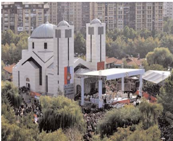
Fig. 06. St. Constantine and Helen, Nis, during the celebration of 1700 years of Edict of Milan, 2013.

Religious buildings have the spatial organization that is conditioned by worshipping needs, while their form is defined more by cultural structures and perception of the symbolic meaning than church rules, which is primarily architectural problem, same as their function is primarily liturgical issue. Therefore, conserving church canons when copying traditional forms is unacceptable both from god worshipping and architectural point of view. Historicism as an approach to solving architectur-