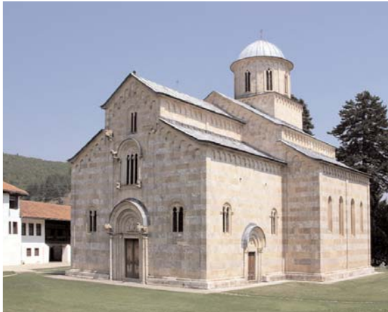
Fig. 03. Visoki Decani monastic church, 1327/35.