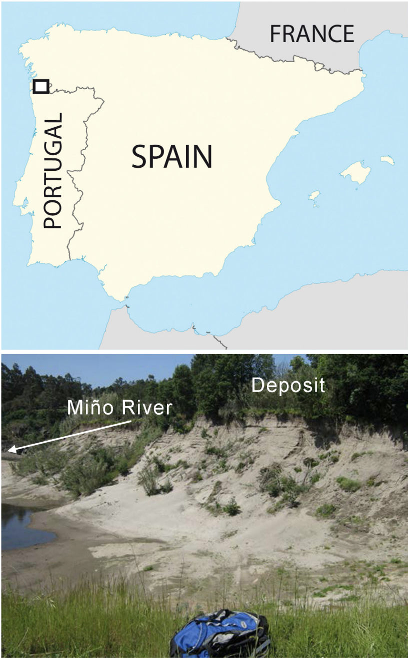
Figure 1. Map of location and picture of the studied deposit.