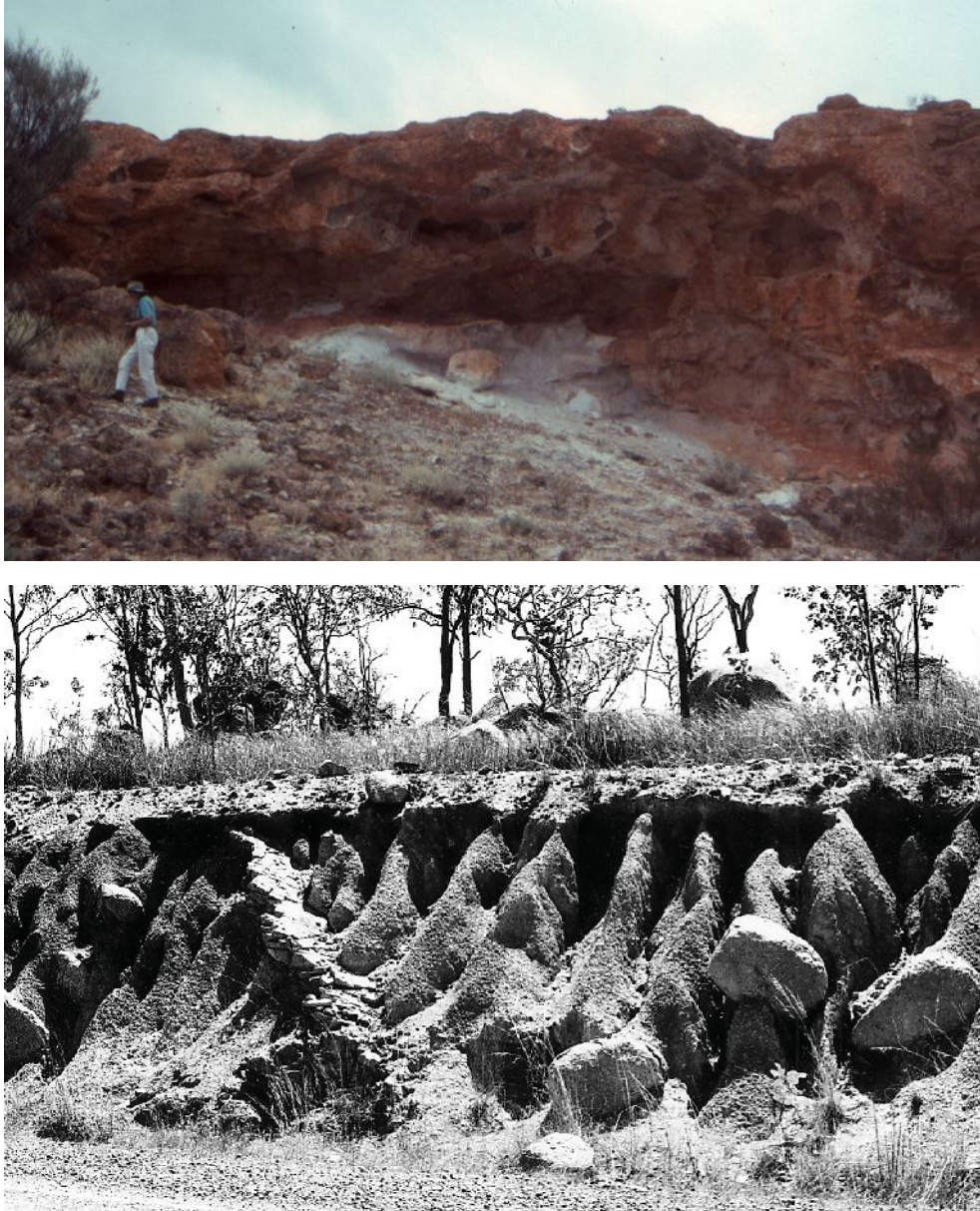
Fig. 2. (a) An example of an etch landscape at The Granites near Mt Magnet, Western Australia, where a blocky granitic surface is exposed as a result of the stripping of a lateritized and kaolinized regolith preserved in plateau remnants. (b) Corestones exposed in a road cutting near Pine Creek, Northern Territory, Australia, provide an example of forms defined by a discrete weathering front, that give rise to surface forms in corestone boulders. That the corestones are in situ and not transported is confirmed by the intrusive vein.