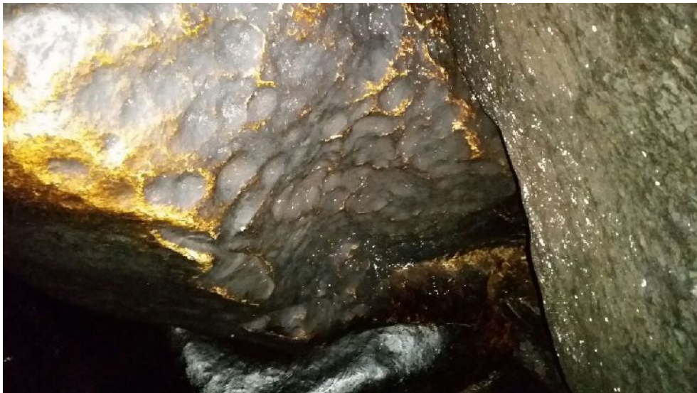
Fig. 1. (a) Pot hole in granite in the bed of the Umgeni River, Kwa-Zulu Natal, Republic of South Africa. (b) Parallel grooves cut in granitic bed of the Ashburton River, at Nanutarra, western Pilbara, Western Australia (c) 'Scallops' shaped in granite exposed in river bed, Davies River, north Queensland.