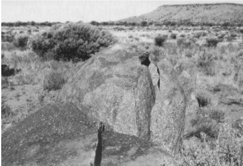
Fig. 3. Surface of blocky gneiss exhumed from beneath flat-lying quartzitic sequence forming a plateau, near Barrow Creek, Northern Territory, Australia.

tralian Basin (TWIDALE and BOURNE, 2013), and in the northern Pilbara region of Western Australia (Figure 4).