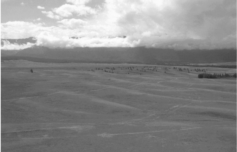
Photo 2. Giant ripples of ancient megaflood in the Altay. The height of ripples is up to 20 m.