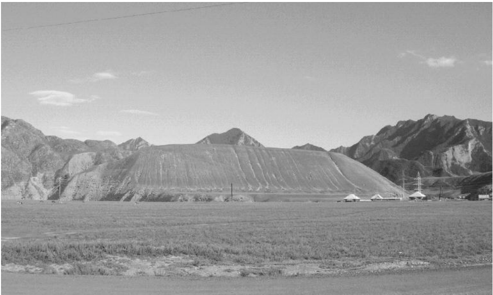
Photo 3. Megaflood terrace in the Altay. The entire terrace was formed as a result of single flood episode.